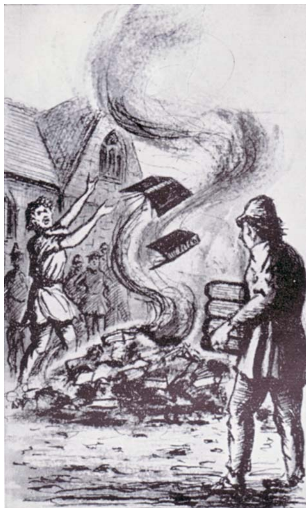
Burning Tyndale's English Bibles

It is a cursed thing to change God's Word in any way, whether by adding to it or taking away from it.