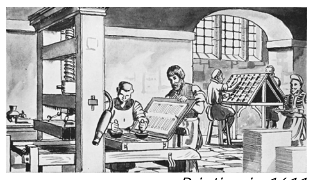
Printing in 1611

This has led to the question, "Which is the right one?" The general answer is the Cambridge Edition. But there are different Cambridge Editions, so only one is actually the right one. The correct presentation of the King James Bible is in the Pure Cambridge Edition.