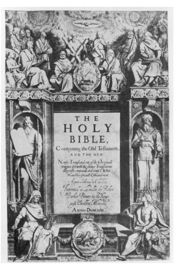
The King James Bible in 1611

True believers who have studied the King James Bible recognise that it is the best Bible. It goes further. It is the best for all time, and it is very perfectly in English, matching exactly what was first written in the original autographs by the prophets, etc.